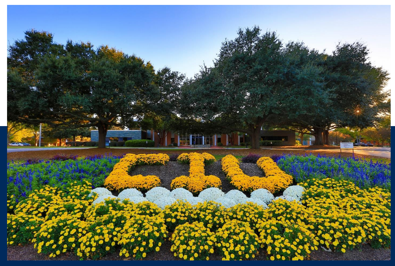
Aducating people from a biblical worldview to impact the nations with the message of Phrist